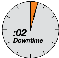
New Cleco D Series

With Cleco's patented design, maintenance time is only 2 minutes!